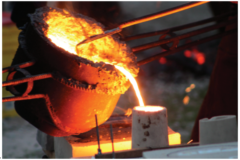
Above and below right: iron pour work in process